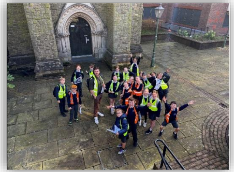
Photos from left to right: Year 2 artwork, Year 1 Science and Year 4 Anti-Bullying Ambassadors