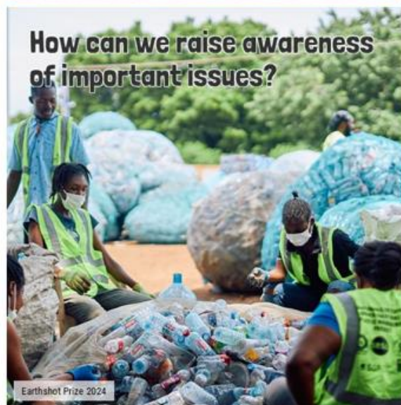
Earthshot Prize 2024