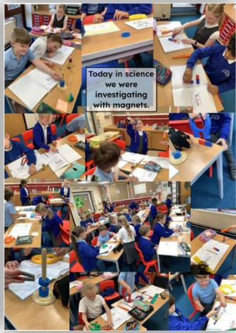
Today in science we were investigating with magnets.

Year 3 had fun learning about magnets this week as part of their Science topic.