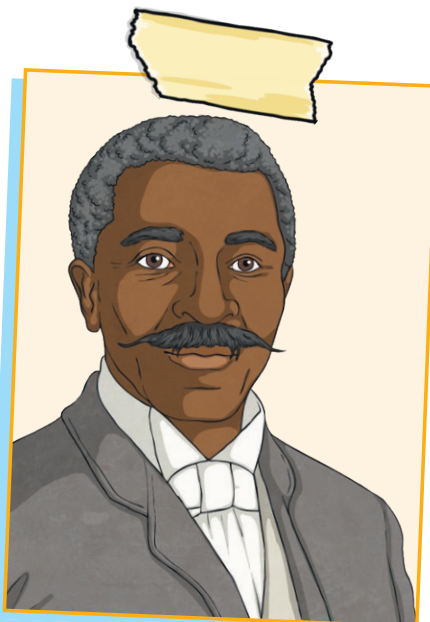
George Washington Carver