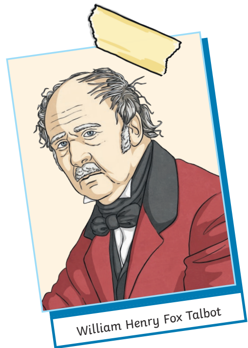
William Henry Fox Talbot