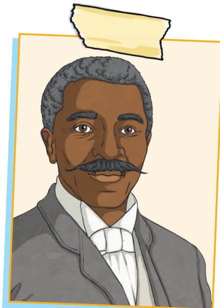
George Washington Carver