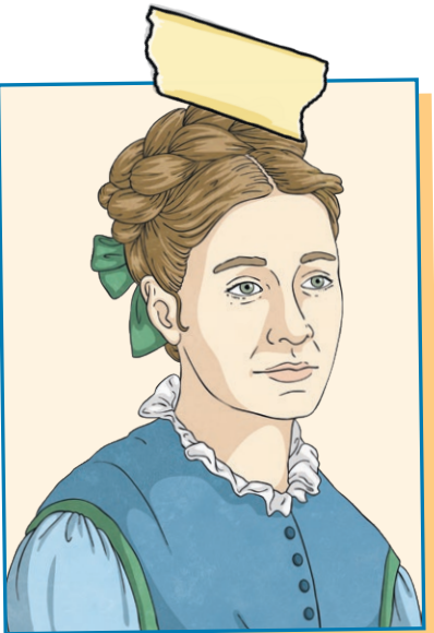
Margaret E. Knight