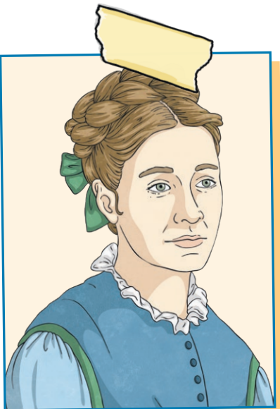
Margaret E. Knight