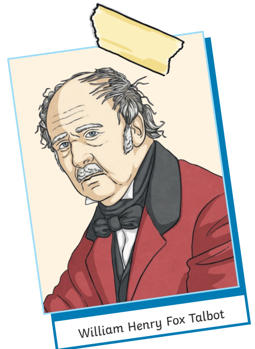
William Henry Fox Talbot